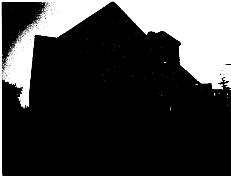
Rear View 07/05/14