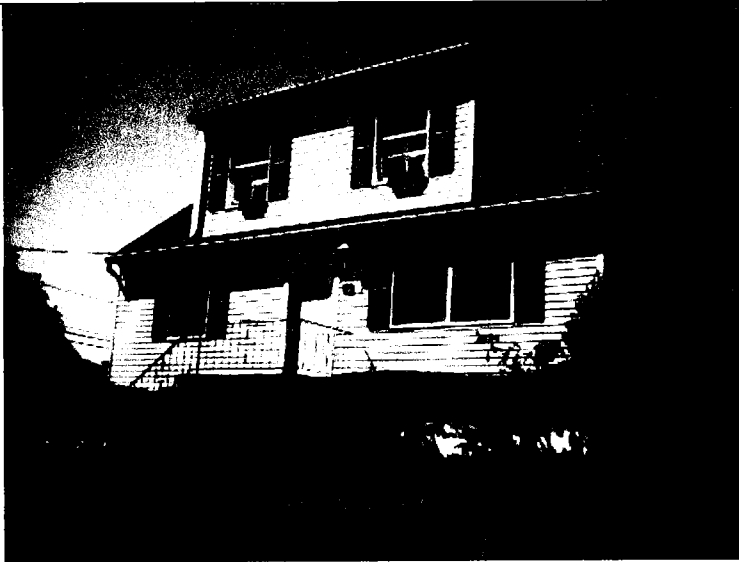
Front View 07/05/14

If using the Elevation Certificate to obtain NFIP flood insurance, affix at least 2 building photographs below according to the instructions for Item A6. Identify all photographs with date taken; "Front View" and "Rear View"; and, if required, "Right Side View" and "Left Side View." When applicable, photographs must show the foundation with representative examples of the flood openings or vents, as indicated in Section A8. If submitting more photographs than will fit on this page, use the Continuation Page.