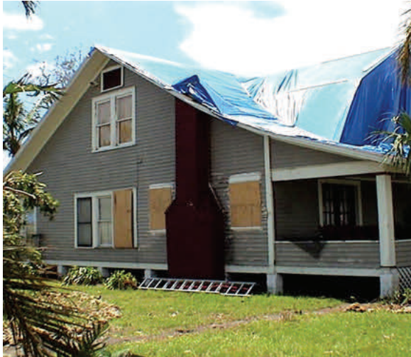
This is an example of a STEP eligible home.